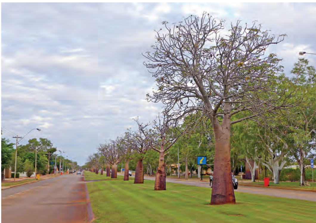
Photo 4 : Boab trees that have been relocated into Derby town site.