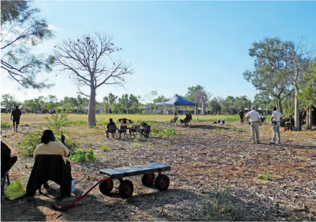
Photo 9 : Interaction between male and female prisoners at the oval with appropriate supervision.