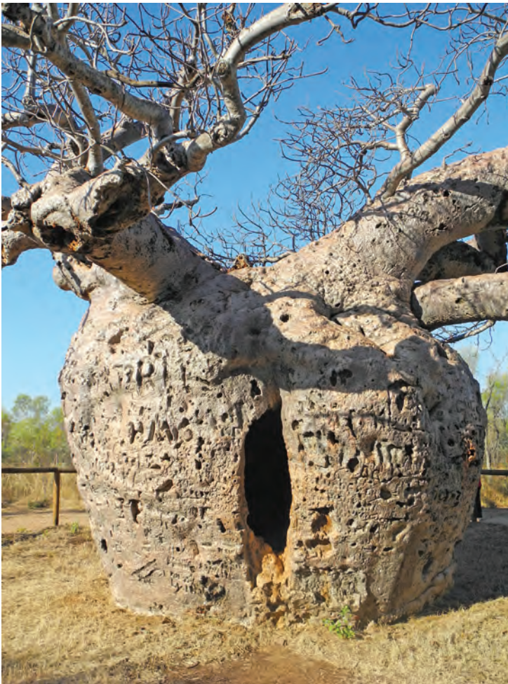
Photo 1 : The Derby Prison Tree. Things have progressed a long way from when prisoners were held in carved out Boab trees.